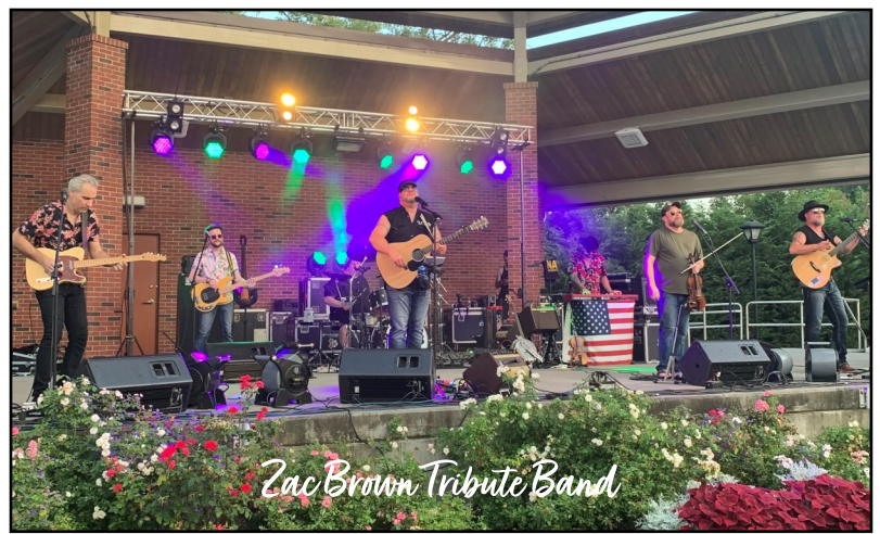
Zac Brown Tribute Band