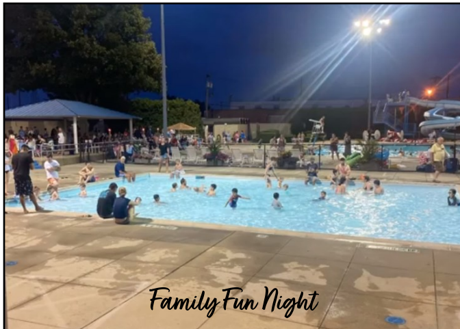
Family Fun Night