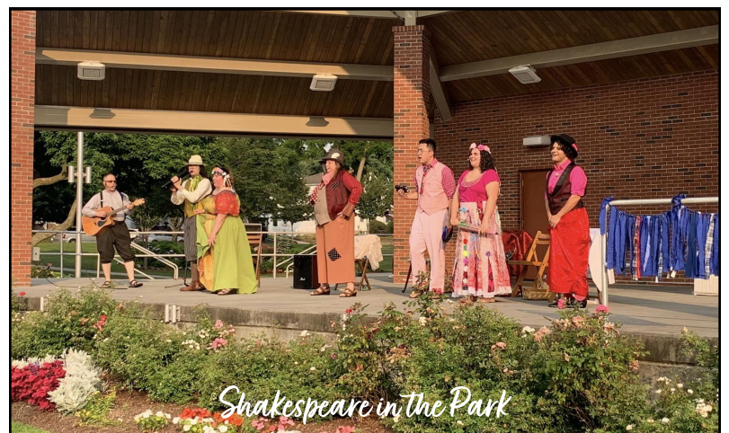
Shakespeare in the Park