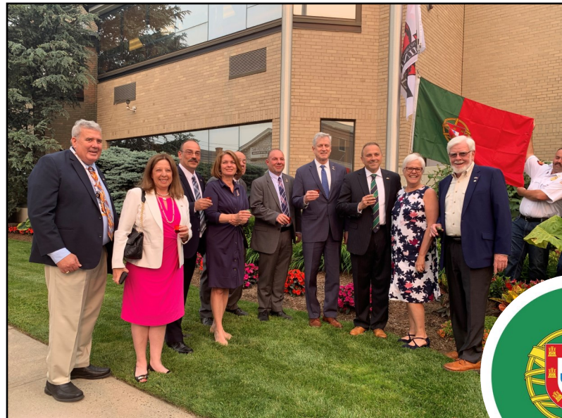
Portugal Day Flag Raising