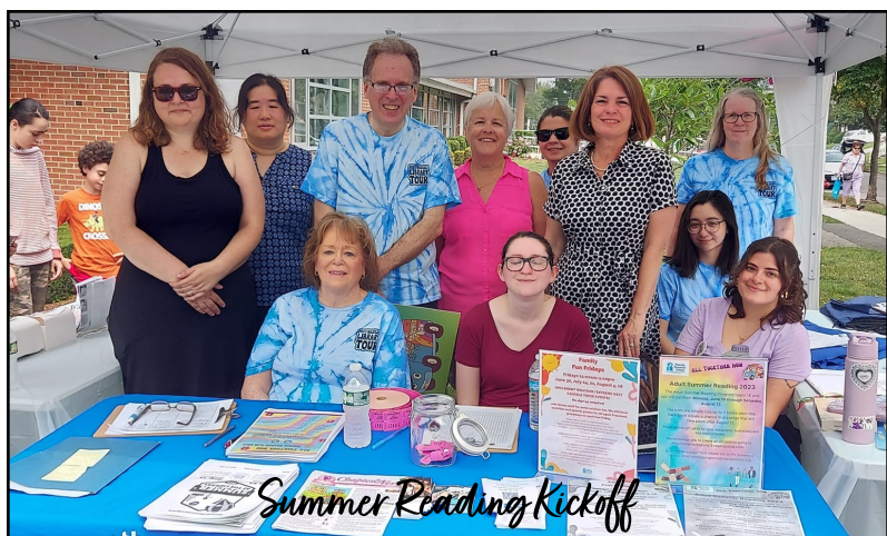
Summer Reading Kickoff