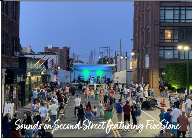
Sounds on Second Street featuring Five Stone