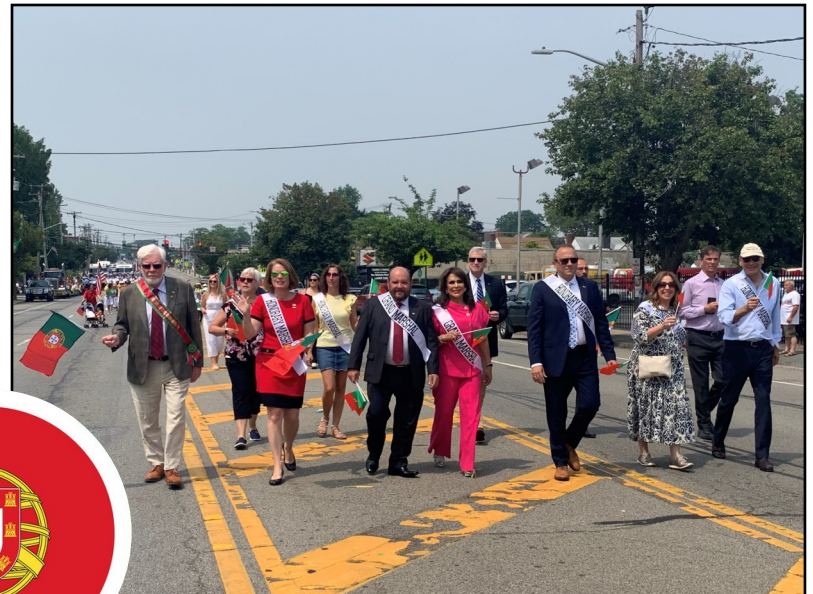
Portugal Day Parade