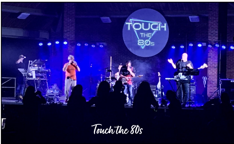
Touch the 80s