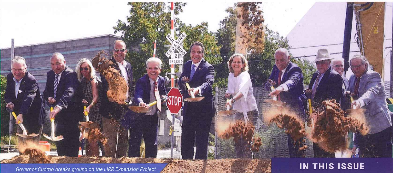
Governor Cuomo breaks ground on the LIRR Expansion Project