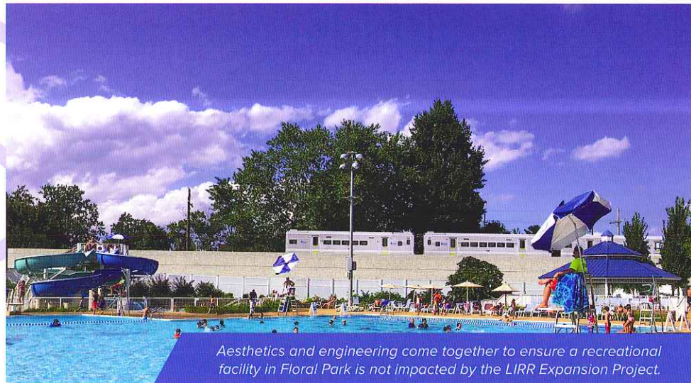
Aesthetics and engineering come together to ensure a recreational facility in Floral Park is not impacted by the LIRR Expansion Project.

The Community Benefits Fund is designed to provide the communities adjacent to the corridor with funds that they may use, subject to certain conditions and limitations, to go beyond the commitments made in the Final Environmental Impact Statement (FEIS) and further offset construction-period impacts. The Community Benefits Fund will support local initiatives intended to ensure community safety and quality-of-life throughout the Project's construction phase.